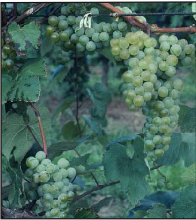
Dr. Helen Fisher

Synonyms: Vineland 53263, V 53263 (1, 2, 3).