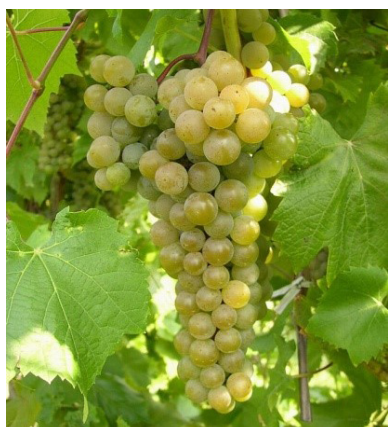
University of Minnesota