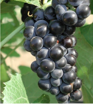
South Dakota St. University