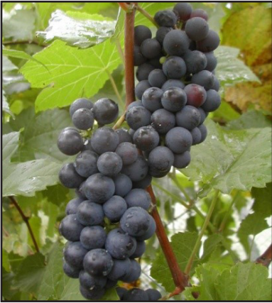
Iowa State University