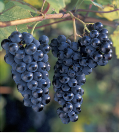
University of Minnesota