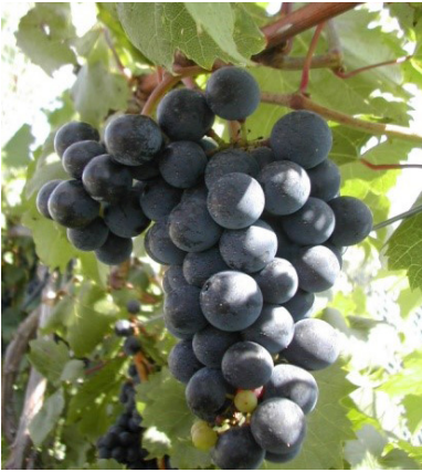
Iowa State University