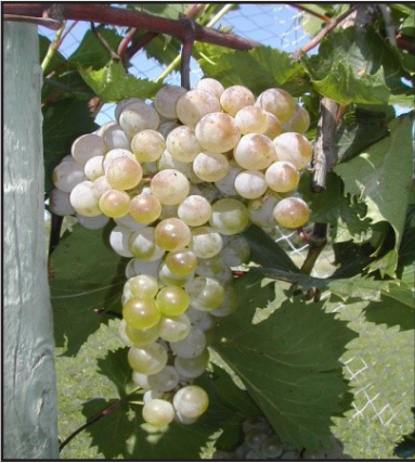
Iowa State University