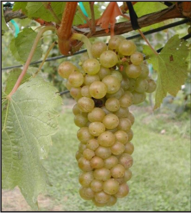
Iowa State University