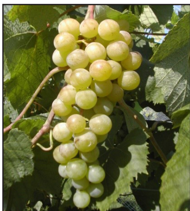
Iowa State University