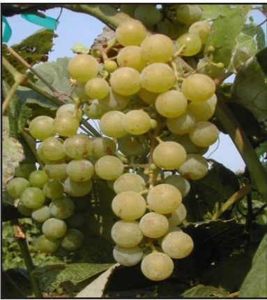
Iowa State University