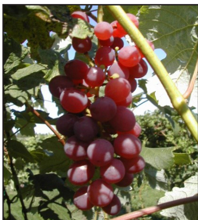
Iowa State University

Synonyms: GF 136, 'Vanessa Seedless', Vineland 65164 (8).