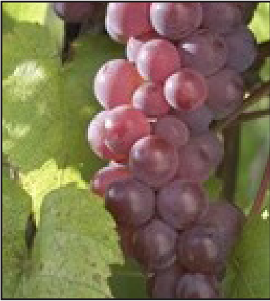
University of Minnesota