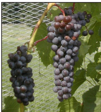
Iowa State University