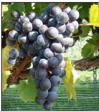
Iowa State University

Pedigree: Uncertain, but may be a chance seedling resulting from a cross between ‘Pinot Noir’ and ‘Chambourcin’, both of which were growing next to each other in the vineyard (7).