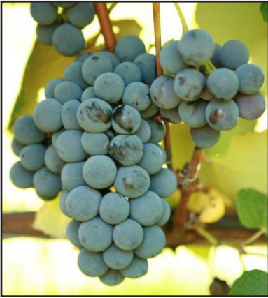
Double A Vineyards, Inc. & ST Photography

Pedigree: ‘Concord’ Open pollinated seedling (2)