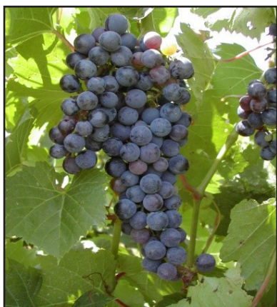
Iowa State University