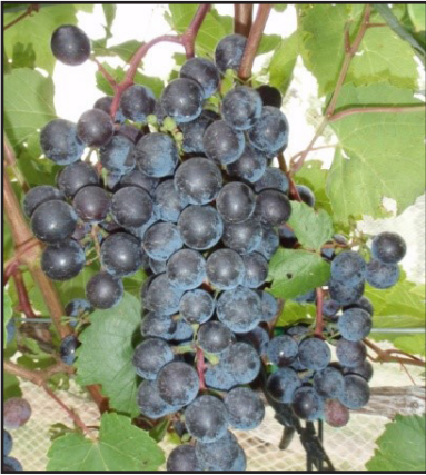
Iowa State University

Synonyms: ‘Cameo’, ‘Dechaunac’, Seibel 9549 (10).