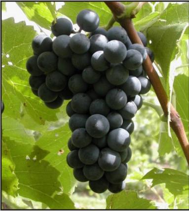
Iowa State University