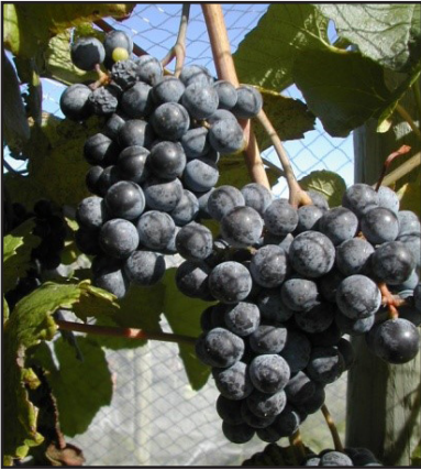
Iowa State University

Synonyms: ‘Arkansas’, ‘Norton’, ‘Norton Virginia’, ‘Norton’s Seedling’, ‘Norton’s Virginia Seedling’, ‘Red River’, ‘Vitis Nortoni’(8)